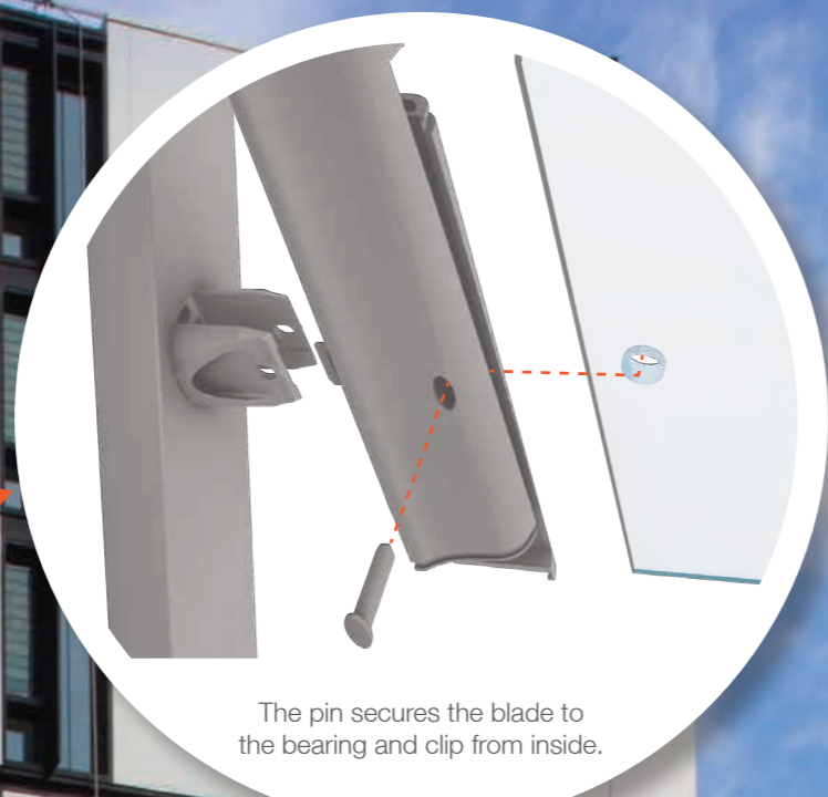
The pin secures the blade to the bearing and clip from inside.

Altair® Louvre Windows with the Stronghold™ System are now the logical inclusion when extra strength and safety is required in commercial or residential buildings.